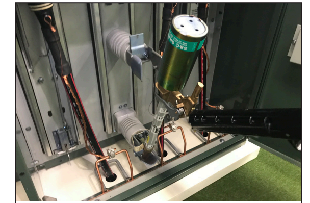
Figure 7. A fuse lowered into the cradle in preparation for latching into a TransFuser Mounting.

Note: Take the blown fuse back to the service center for proper disposal.