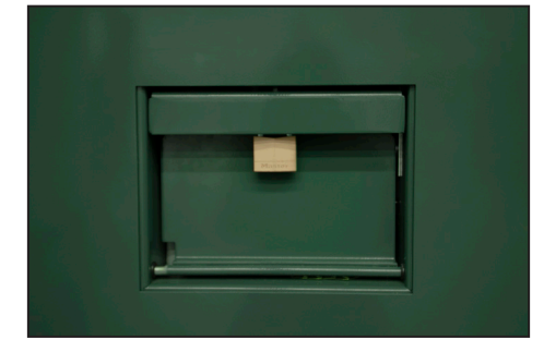
Figure 2. Switch access cover padlock.