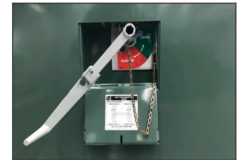
Figure 3. The access cover open and folding switch operating handle installed.