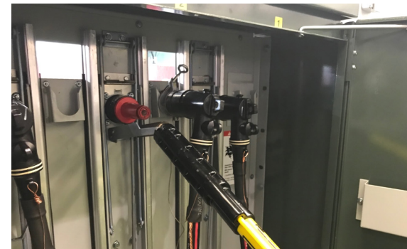
Figure 4. Raising the mechanical interlock to unlock the TransFuser Mounting.

Manual PME Pad-Mounted Gear's TransFuser Mountings can accommodate Type SME-20 Power Fuses, Type SME-4Z Power Fuses, or Fault Fiter® Electronic Power Fuses. Fault Fiter fuse mountings also accommodate a variety of current-limiting fuses.