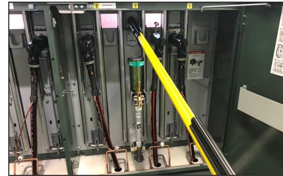
Figure 6. Latching (or unlatching) a TransFuser Mounting in the Open position.