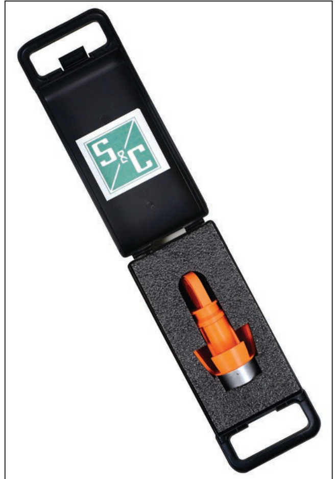
Figure 1. Cordless power module in carrying case.

The TripSaver II Cutout-Mounted Recloser Cordless Power Module comes in a foam-padded carrying case. See Figure 1. A 9-V battery is included. When not in use, the cordless power module should be stored in its carrying case. The carrying case should be stored in a protected area, such as inside of a truck or indoors in a service center. Use care not to drop the cordless power module during installation and removal.