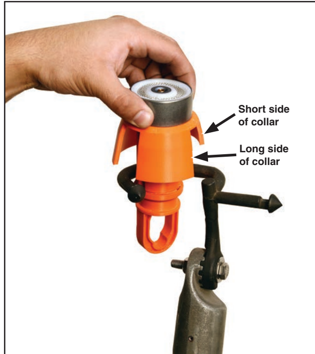
Figure 3. Place the power module on the Talon tool.