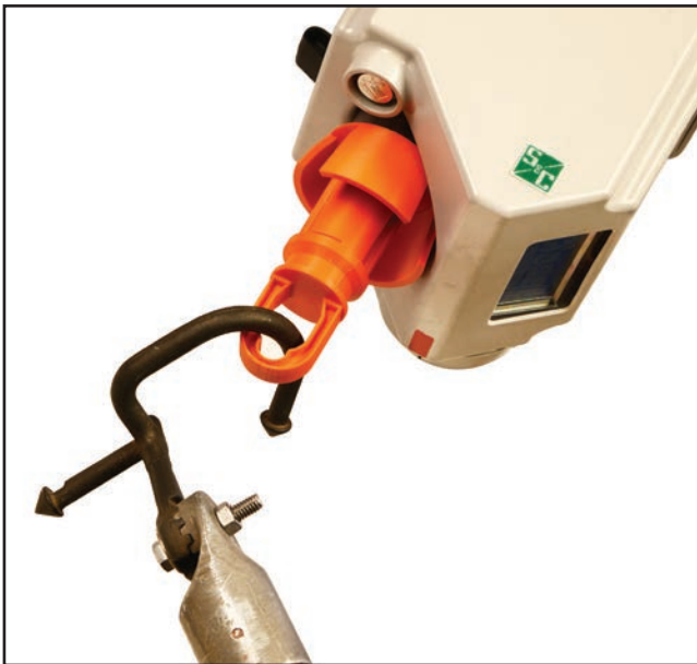
Figure 7. Hook the Talon tool through the pull-ring on the module.

STEP 1. Hook the U-shaped part of the Talon Handling Tool through the pull-ring of the cordless power module. See Figures 7 and 8.