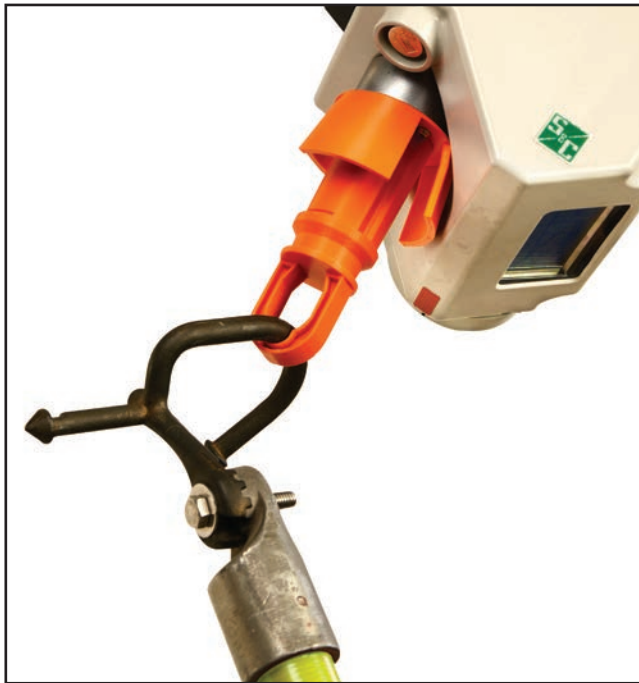
Figure 8 Make sure the hook is fully engaged with the Talon tool.

STEP 2. Pull the module away from the TripSaver II recloser. See Figures 9 and 10.