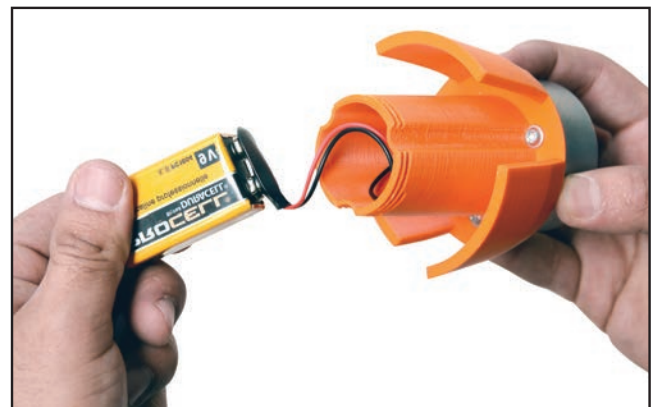
Figure 13. Train the wires inside the body of the module and replace the pull-ring.