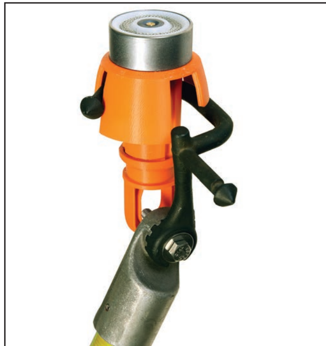
Figure 4. Make sure the cordless power module is secure on the talon tool.