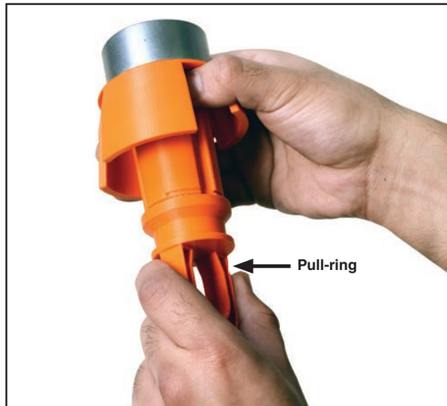
Figure 11. Unscrew the pull-ring from the base of the module.

STEP 1. Unscrew the pull-ring from the base of the module. See Figure 11.