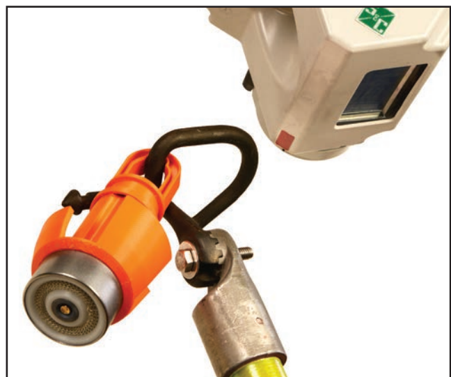
Figure 10. Lower the module and remove from the Talon tool.