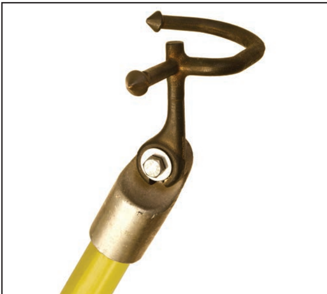
Figure 2. Attach the Talon tool to the hookstick.