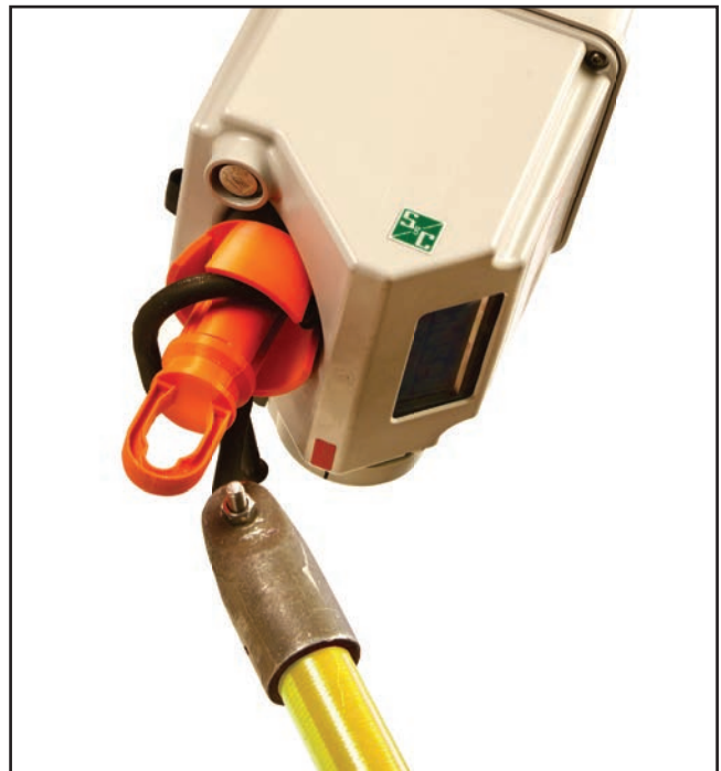
Figure 6. Lift the cordless power module and attach it to the base of the TripSaver II recloser.