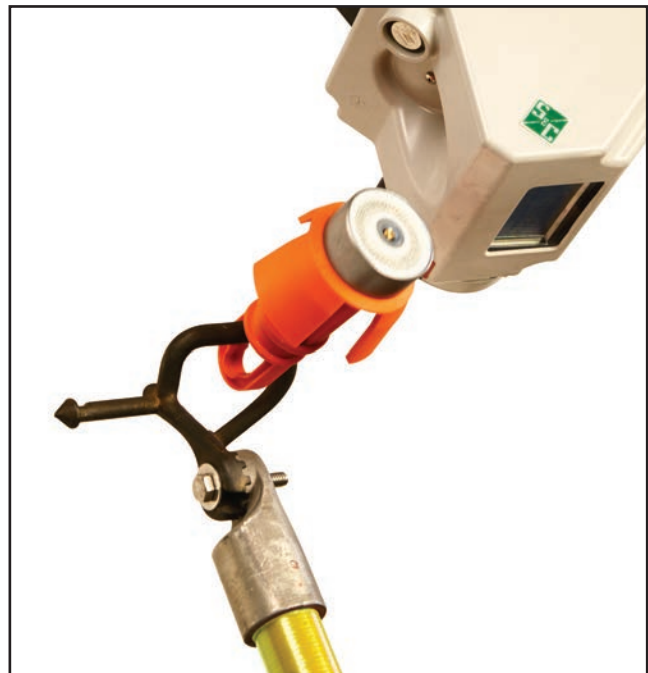
Figure 9. Pull the module away from the TripSaver II recloser.

STEP 3. Store the cordless power module in its case. See Figure 1 on page 7.