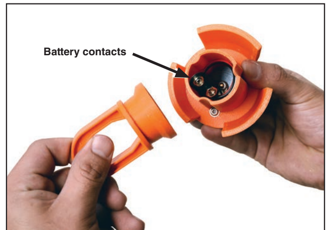
Figure 12. The battery compartment inside the cordless power module.

STEP 4. Screw the pull-ring onto the base of the module.