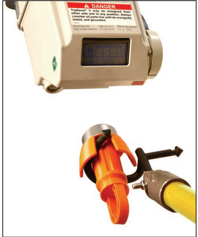
Figure 5. Keep the cordless power module level while lifting.

Keeping the hookstick level, raise the cordless power module to the height of the TripSaver II recloser and position it against the base of the unit. The module will be held in place magnetically.