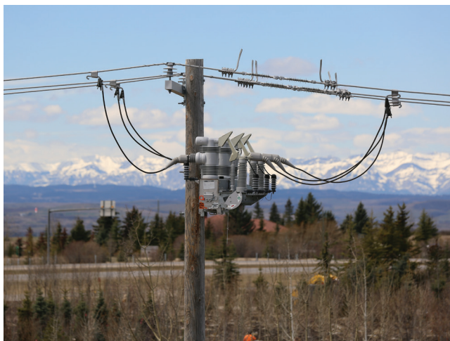
Figure 1. One of S&C's IntelliRupter® PulseCloser® Fault Interrupters ENMAX deployed to address momentary interruptions.

ENMAX conducted extensive reliability studies to ascertain the best locations for the automation switching points. S&C conducted a radio-frequency study, training ENMAX personnel to perform this work as they expanded the system and the radio communication system that enabled peer-to-peer communication between the switches deploying S&C's IntelliTeam®II Automatic Restoration System. Using the results of that research, S&C and ENMAX designed a comprehensive plan, assessing the most cost-effective use of resources to target the worst-performing feeders and to ensure the utility obtained the maximum value from the system.